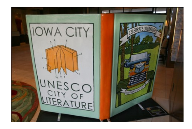
Iowa City's designation as a world City of Literature has brought much attention to the important role that the arts play in Iowa City's history and culture.