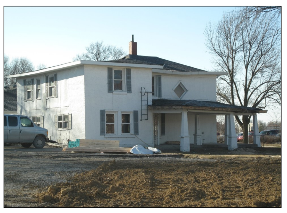
Photo of the Tate Arms prior to the recent renovation, December 2014.