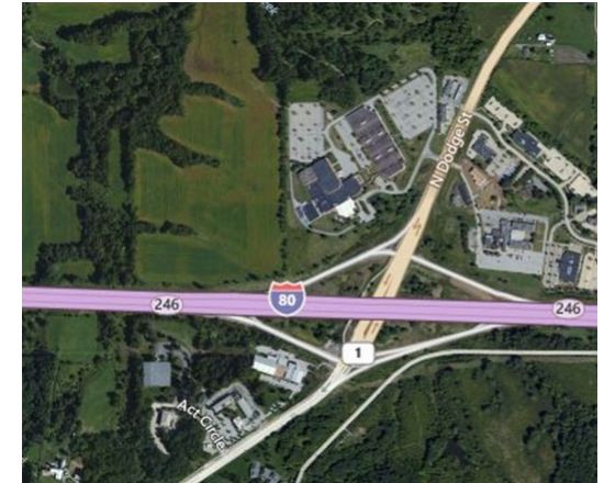
Aerial view of the Moss Ridge Development property, located to the west of the NCS Pearson campus.

The Moss Ridge Development is a proposed 172-acre class A office park to be located west of NCS Pearson. The will expand Iowa City's Office Research Park zone, adding to a major employment center at the Interstate 80 and Highway 1 intersection.