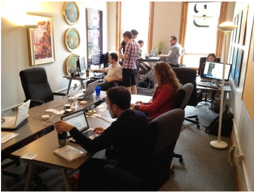
Photo of an office in Busy Coworking located above the Chait Galleries in downtown Iowa City.

Encouraging entrepreneurship and small start-up businesses is an important economic goal of the Comprehensive Plan. To that end the City of Iowa City has provided support for two coworking offices: Busy Coworking and the Iowa City Area Development Group's IC Colab. For a membership fee, entrepreneurs get access to offices, conference rooms, wi-fi, printing, and photocopying on an as-needed basis. Coworking also provides unique opportunities for networking and collaboration between businesses.