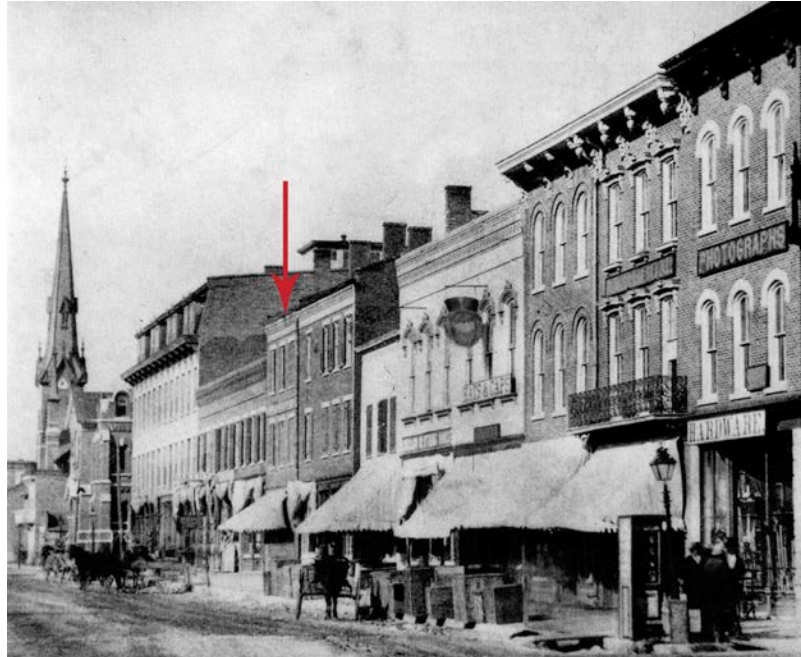
Image 03. Historic Image – 1874-1892