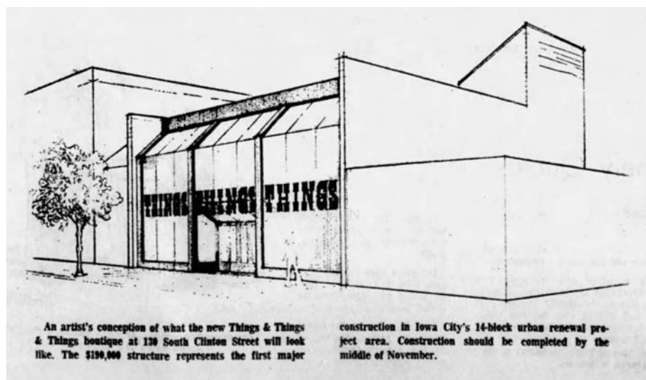
Figure 02. Architects Rendering - 1970